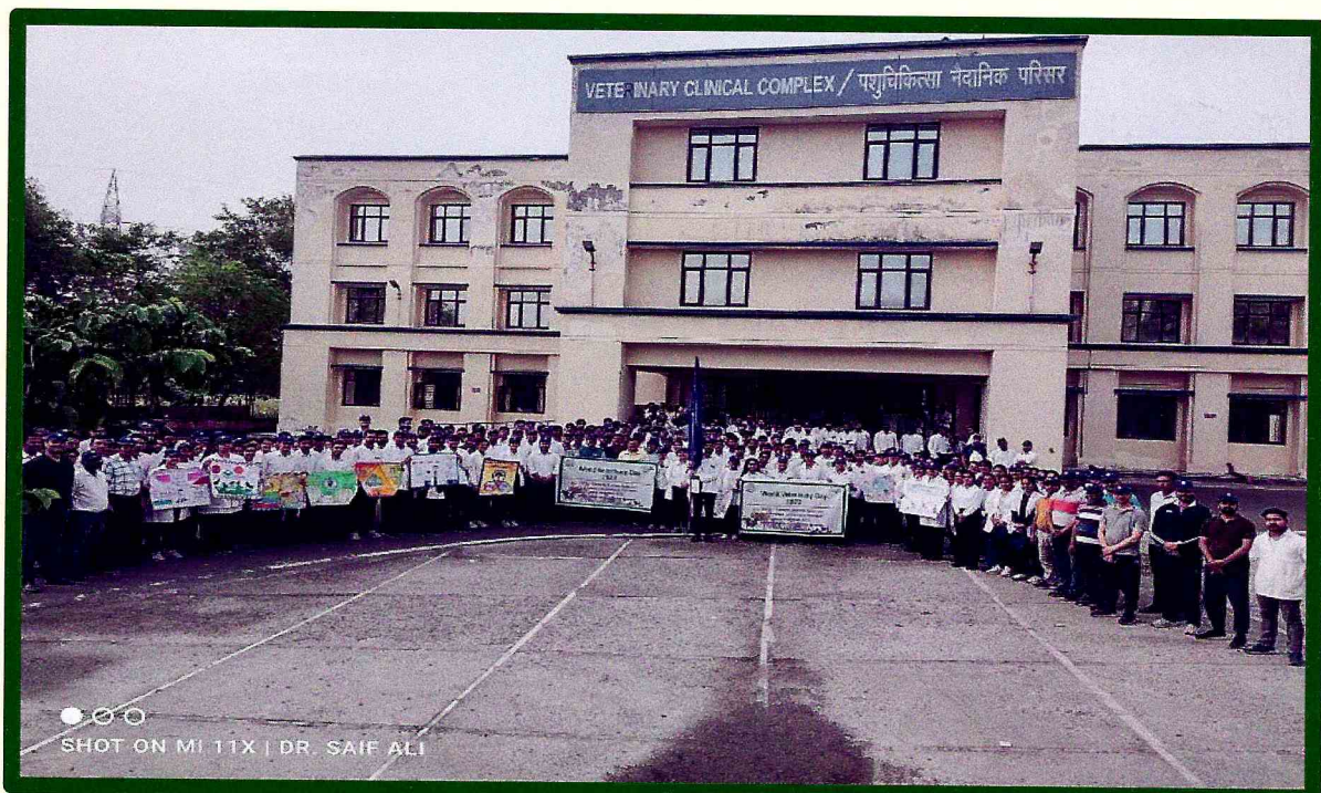
All Veterinary College faculty and students (with their poster) group photo on World Veterinary Day held on 27 April, 2023