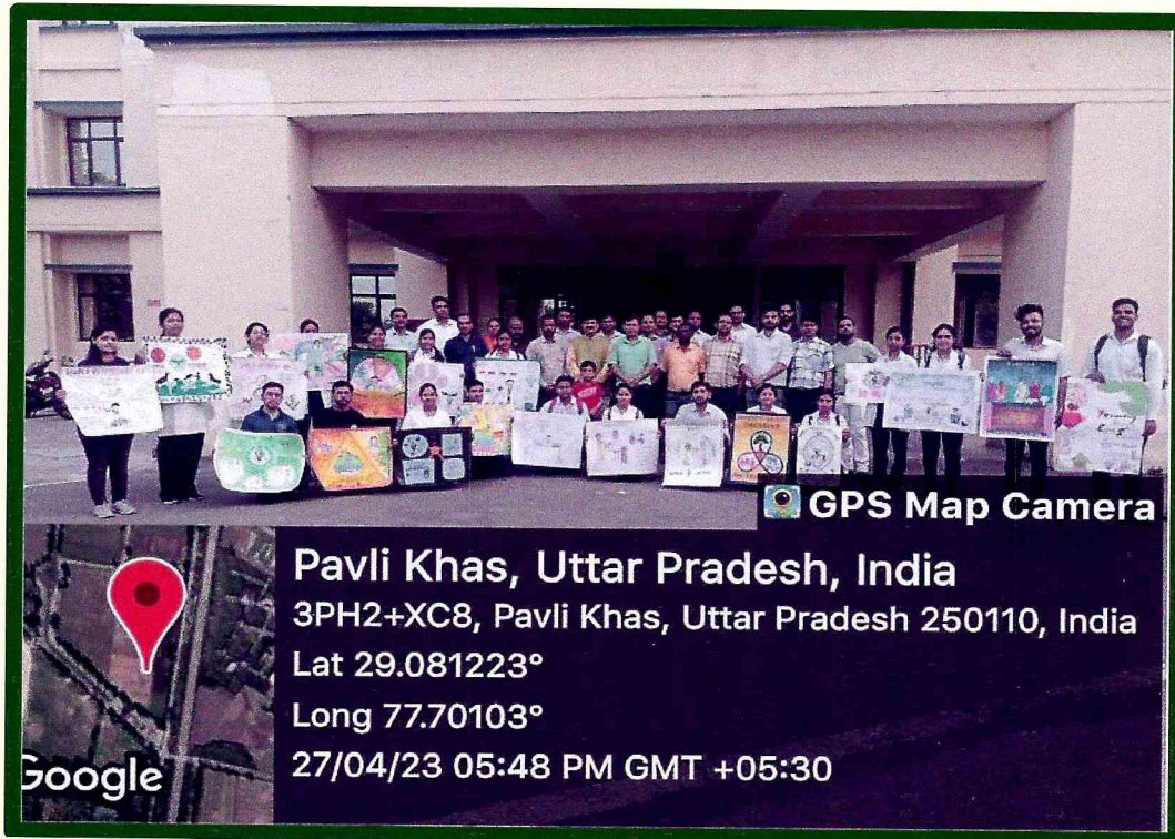
All Veterinary College faculty and students (with their poster) group photo on World Veterinary Day held on 27 April, 2023