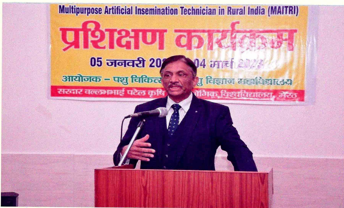
Hon'ble Vice Chancellor addressing to the audience in the training programme on Multiple Purpose Artificial Insemination Technician in Ruler India held on 4 March 2023