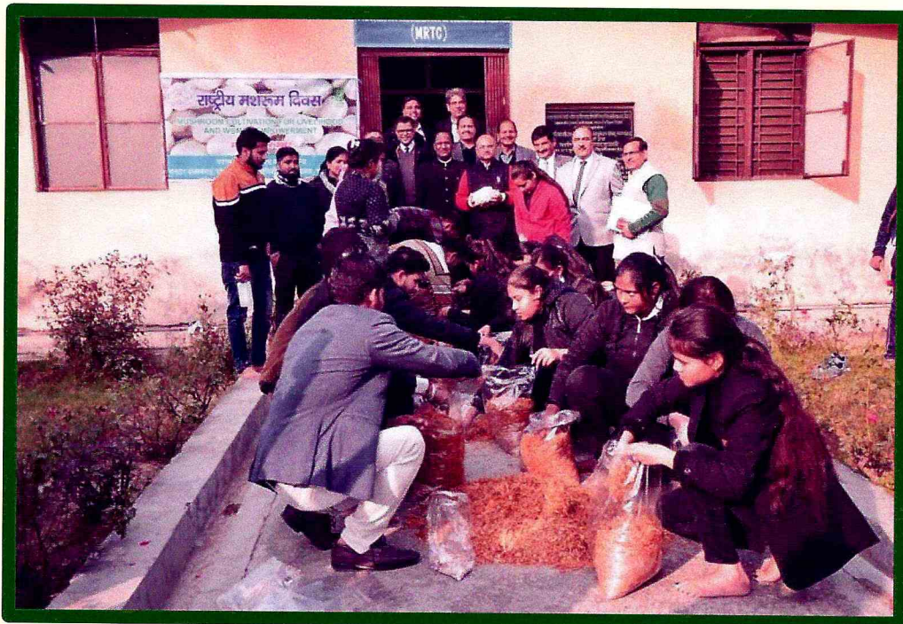
Students got training on Mashroom on the National Mashroom Day held on 23 December, 2023