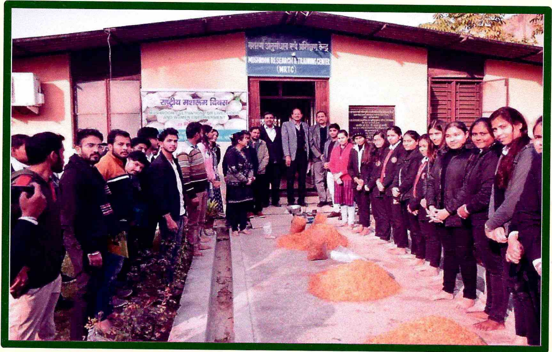
Students got training on Mashroom on the National Mashroom Day held on 23 December, 2023