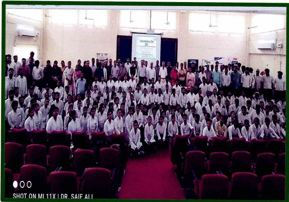
All Veterinary College faculty and students group photo on World Veterinary Day held on 27 April, 2023