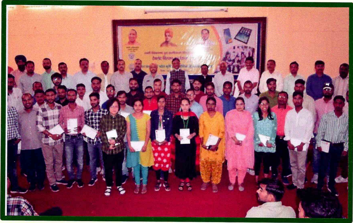
Group photograph of faculty and students after Tablet distribution 12.1. 2023